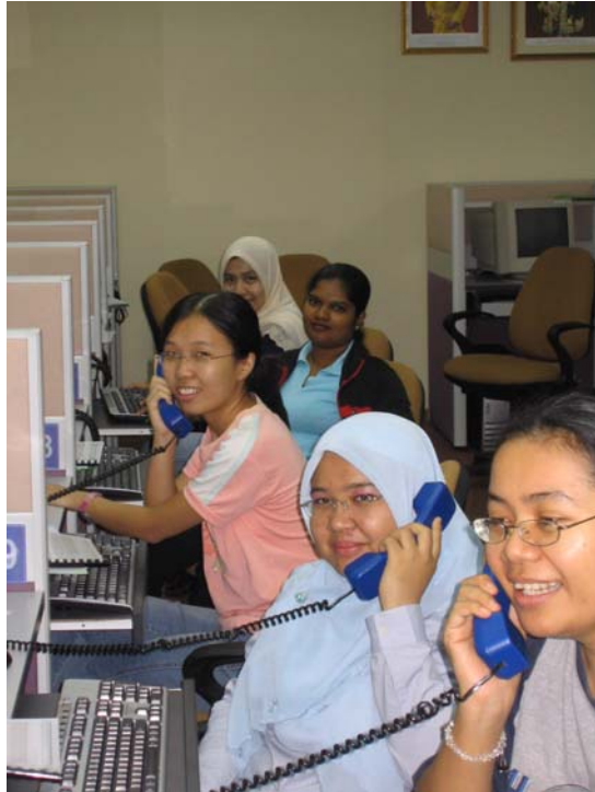
Happy, cheerful interviewers get better responses

In both cases pains were taken to explain to respondents the purpose of the survey.