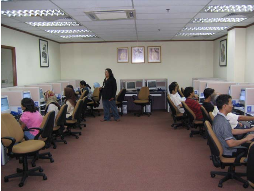
MCMC CATI Centre Fieldwork is closely supervised

Trained interviewers call respondents from the MCMC CATI centre regardless of whether they have Internet access at home or not. Those contacted but had no Internet access at home at reference date fell into the “non-user” sample while those with Internet access at home at reference date fell into the “user” sample.